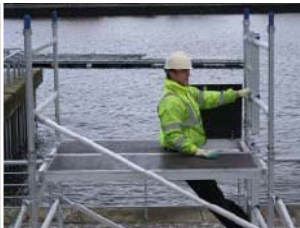
Figure 2 "Standing" Position

During the practical and technical workshops both positions were examined to determine if guidance should be more specific or if either position was more advantageous. In the research examining the two positions carried out on behalf of PASMA and the HSE by the Health & Safety Laboratory (HSL), the "seated" position was considered to be the preferable position.