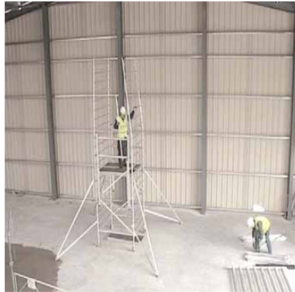
Figures 1 and 2 Advance guard rail

The first method, an advance guard rail system, makes use of specially designed temporary guard rail units, which are locked in place from the level below and moved up to the platform level. The temporary guard rail units provide collective fall prevention and are in place before the operator accesses the platform to fit the permanent guard rails. The progressive erection of guard rails from a protected area at a lower level ensures the operator is never exposed to the risk of falling from an unguarded platform.