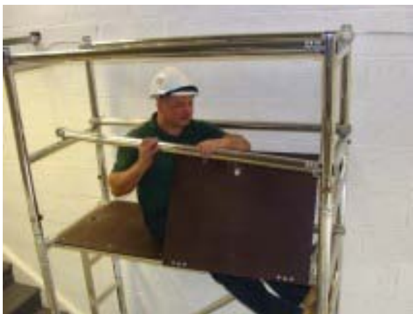
Figure 1 "Seated" Position