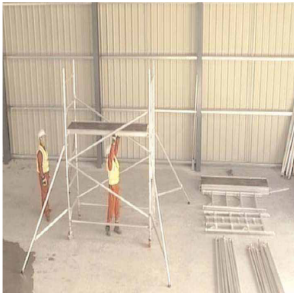
Figures 3 and 4 'Through the trap' (3T)

The 3T method makes use of standard tower components.